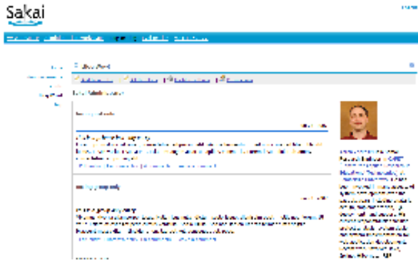
Viewing a blog